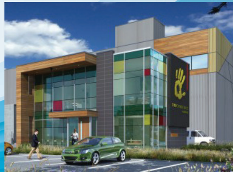
Tricentris, Lachute Félix-Touchette Road, Lachute, Quebec, Canada