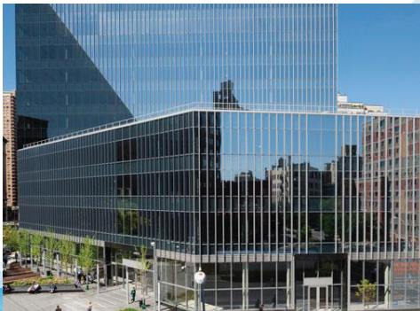
51 Astor 25 Cooper St, New York, NY 10034, United States