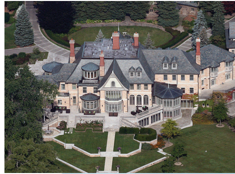
Edgemere 1502 Lakeshore Road E., Oakville, Ontario, Canada