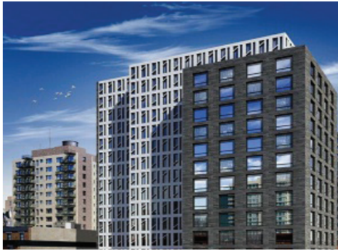
444 10th Avenue North New York, NY 10001. USA

We are proud supplier for the following completed and on going projects :