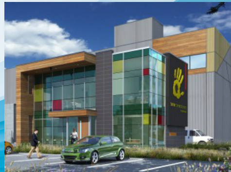
Tricentris, Lachute Félix-Touchette Road, Lachute, Quebec, Canada