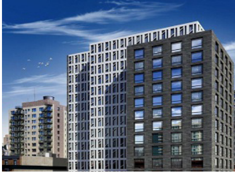
444 10th Avenue North New York, NY 10001. USA

We are proud supplier for the following completed and on going projects :