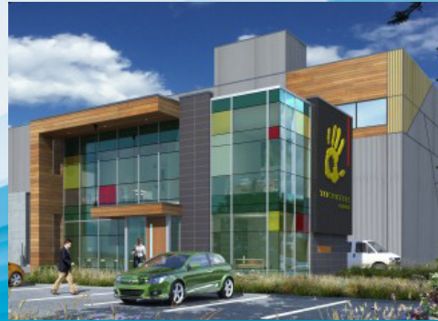
Tricentris, Lachute Félix-Touchette Road, Lachute, Quebec, Canada