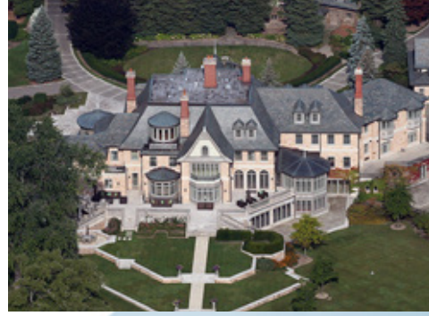
Edgemere 1502 Lakeshore Road E., Oakville, Ontario, Canada