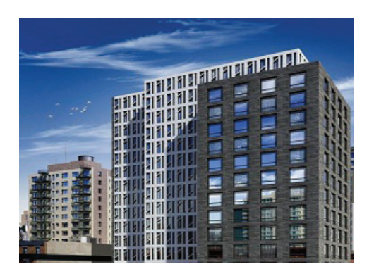
444 10th Avenue North New York, NY 10001. USA