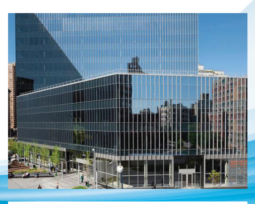
51 Astor 25 Cooper St, New York, NY 10034, United States