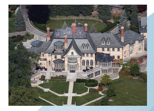
Edgemere 1502 Lakeshore Road E., Oakville, Ontario, Canada