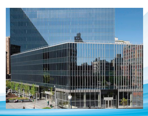
51 Astor 25 Cooper St, New York, NY 10034, United States