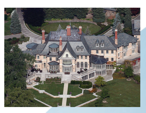
Edgemere 1502 Lakeshore Road E., Oakville, Ontario, Canada