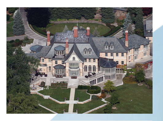
Edgemere 1502 Lakeshore Road E., Oakville, Ontario, Canada