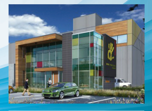
Tricentris, Lachute Félix-Touchette Road, Lachute, Quebec, Canada