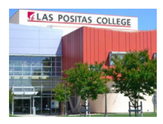
Las Positas College 3000 Campus Hill Dr, Livermore, CA, USA 94551