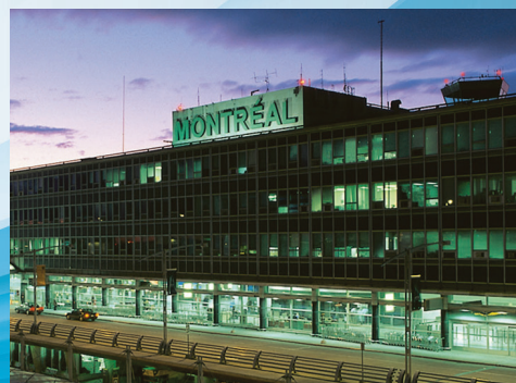
Montréal - P.E.T International Airport, 975 boul. Roméo-Vachon Dorval, Quebec, H4Y 1H1