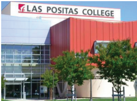
Las Positas College 3000 Campus Hill Dr, Livermore, CA, USA 94551

We are proud supplier for the following completed and on going projects :