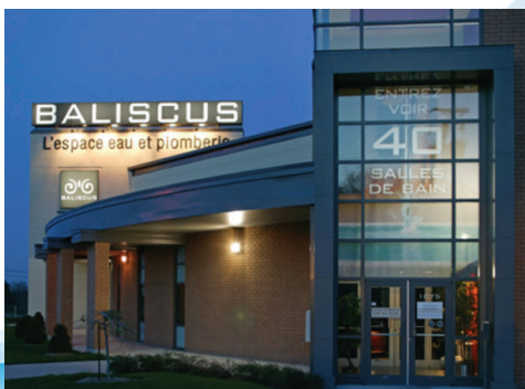
Baliscus 1075 Grand Héron Boul., Saint-Jérôme, QC, CA J5L 1G2