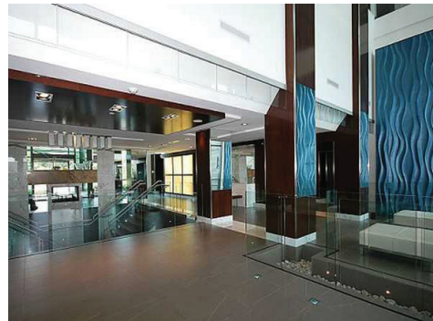
The West Mall 25 The West Mall, Toronto, ON M9C 1B8