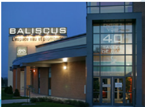
Baliscus 1075 Grand Héron Boul., Saint-Jérôme, QC, CA J5L 1G2