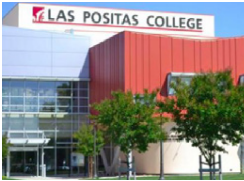
Las Positas College 3000 Campus Hill Dr, Livermore, CA, USA 94551

We are proud supplier for the following completed and on going projects :