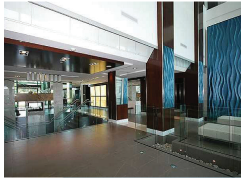
The West Mall 25 The West Mall, Toronto, ON M9C 1B8